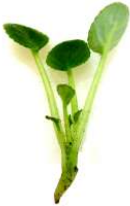
Un-rooted Baby Item # 29990:

Optimara now offers its customers an even greater selection of its already unsurpassed Violet program. The Optimara varieties are easy-to-grow and come in many captivating colors. With over 50 varieties available in four stages, Optimara offers a program no other grower offers to their customers. Holtkamp Greenhouses is the proud recipient of the 1999 SAF Gold Medal Award honoring the originator of a widely distributed plant that has become established as having an outstanding horticultural and commercial value.