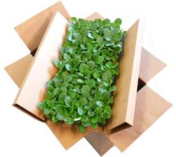
Starter / Liner Item # 30000:

A premium un-rooted baby (cutting) 2" to 2 1/2" in length, featuring a strong center heart, handpicked and graded for constant caliper. Six to seven weeks to potting. Only 9 to 10 weeks after potting for a premium finished product.