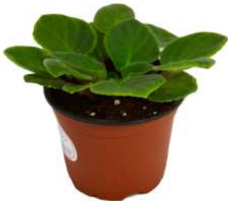
Small Pre-Finished Item # 40020

Only 9 to 10 weeks to finish. Large selection of over 50 varieties in the 4 inch series. Tray of 84 (4 tray min). Additional sizes: super-sized 6 inch series and the 2 inch miniature varieties.