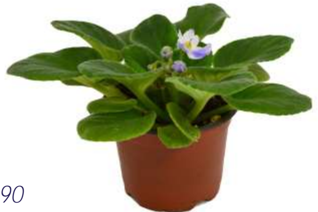
Large Pre-Finished Item # 40030

Only 3-4 weeks from Finished. Assorted Varieties. Vigorous growth with many visible buds. Set to final spacing.