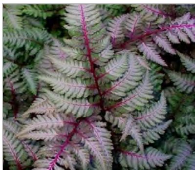
Regal Red Japanese Painted