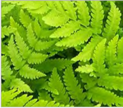
Southern River Wood